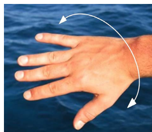
Something is wrong