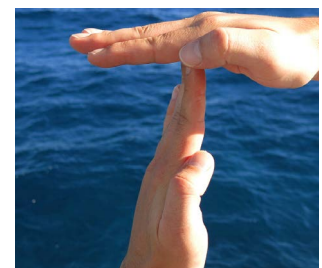
Time to head back