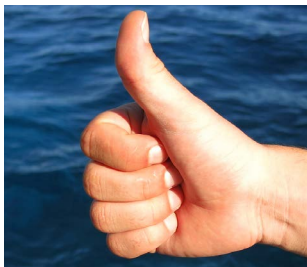
Ascend (go up)

Try to copy each of the dive signs. Scientists working underwater must remember them all. When you are ready try out the dive signs on your partner. Can your partner work out what you are communicating to them? What does your partner reply?