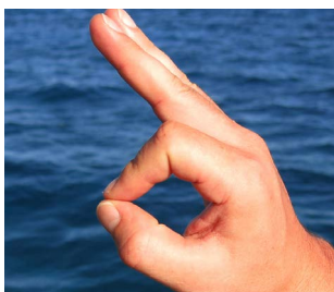
Are you OK? I am OK?