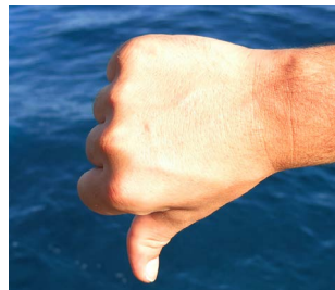
Descend (go down)